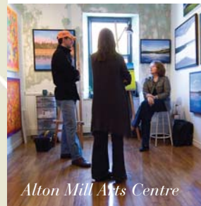
Alton Mill Arts Centre