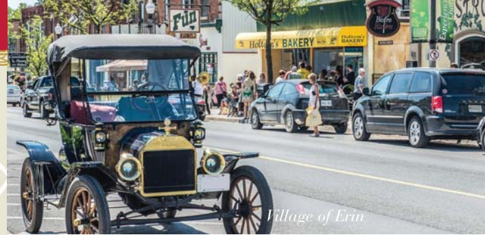
Village of Erin